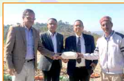
CPU Hamirpur IGFR (Indian Grassland & Fodder Research Institute) Jahnsi, Govt. of India