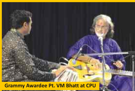
Grammy Awardee Pt. VM Bhatt at CPU

To felicitate learning beyond classroom and to take students' hobby to the next level many cultural and recreational activities are organised through the year by student committees. Largest techno-cultural annual event of the region 'Immix' is organised where students learn many life skills like managerial skills, communication skills, negotiation skills, financial skills, team leading etc.