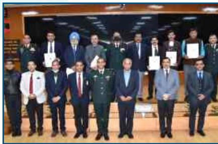
MOU with ARTRAC, Shimla (HP) Ministry of Defense, Govt. of India