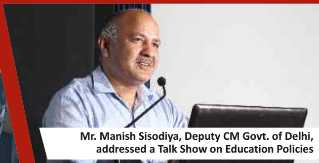
Mr. Manish Sisodiya, Deputy CM Govt. of Delhi, addressed a Talk Show on Education Policies