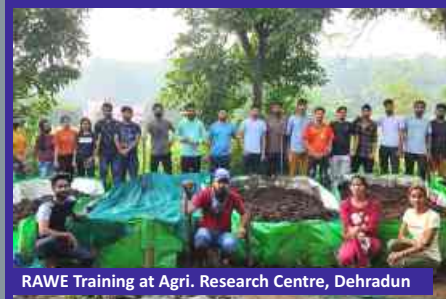
RAWE Training at Agri. Research Centre, Dehradun