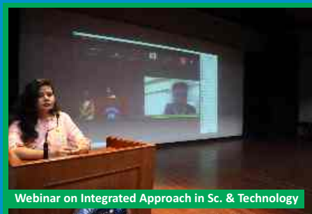
Webinar on Integrated Approach in Sc. & Technology