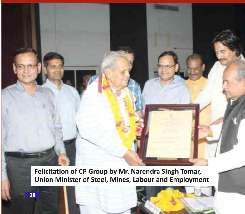
Felicitation of CP Group by Mr. Narendra Singh Tomar, Union Minister of Steel, Mines, Labour and Employment