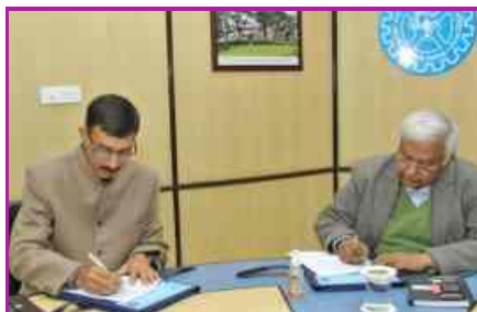
MOU with CSIR-Institute of Himalayan Bioresource Tech. (Govt. of India)