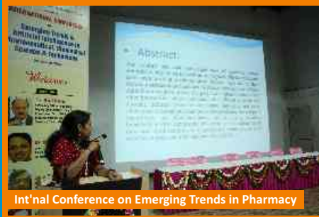
Int'l Conference on Emerging Trends in Pharmacy