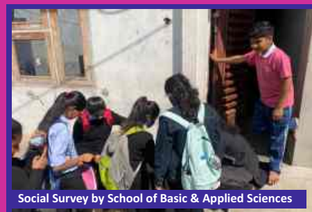
Social Survey by School of Basic & Applied Sciences