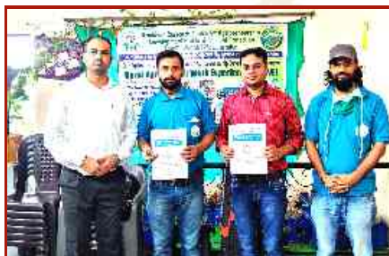
MOU with Krishi Van Research Centre, Dehradun