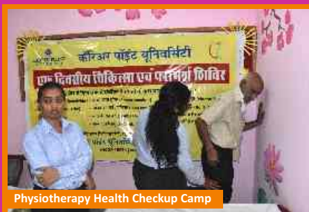
Physiotherapy Health Checkup Camp