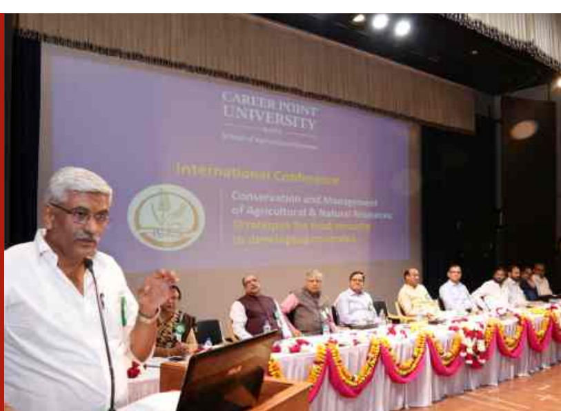
Mr. Gajendra Singh Shekhawat (Minister of State for Agriculture & Farmers Welfare) Addressing in International Conference for Agriculture at CPU