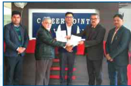
MOU with ICAR- Indian Institute of Soil & Water Conservation, Research Centre, Kota