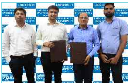
MOU with Samatrix.io