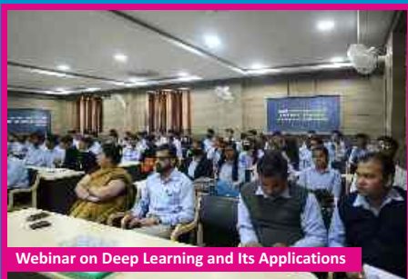
Webinar on Deep Learning and Its Applications