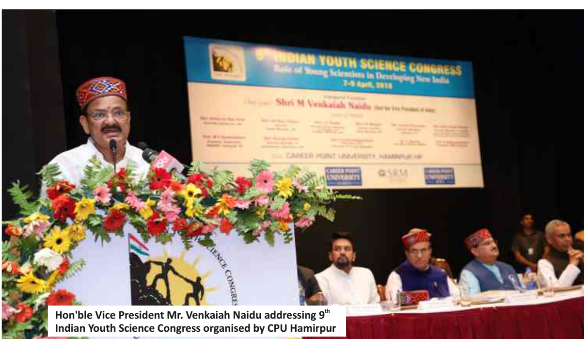
Hon'ble Vice President Mr. Venkaiah Naidu addressing 9 th Indian Youth Science Congress organised by CPU Hamirpur