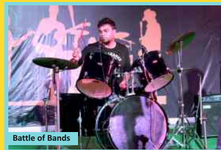
Battle of Bands