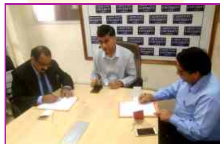
MOU with ICSE Mohali