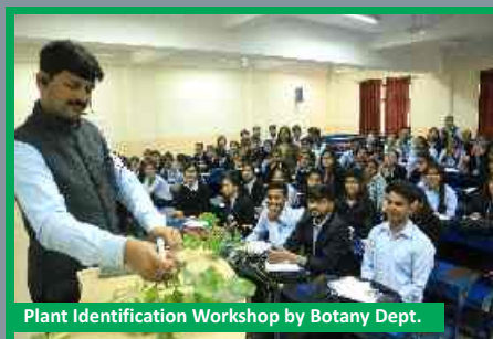
Plant Identification Workshop by Botany Dept.