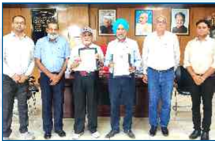
MOU with Sri Karan Narendra Agriculture University, Jobner, Jaipur