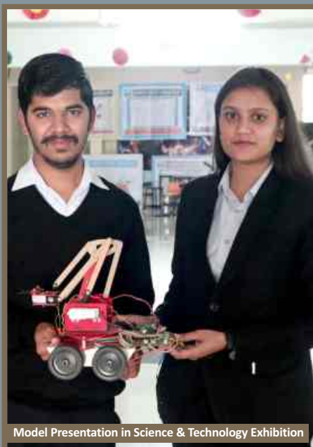
Model Presentation in Science & Technology Exhibition