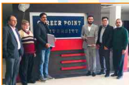
MOU with Vertus Foundation, New Delhi