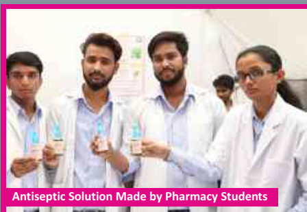
Antiseptic Solution Made by Pharmacy Students