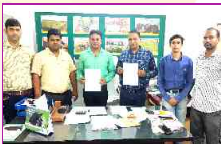
MOU with Vidhya Bhawan Krishi Vigyan Kendra, Udaipur (Raj.)