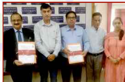
MOU with ICSR Mohali