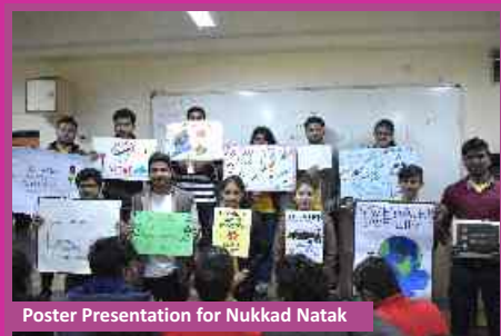
Poster Presentation for Nukkad Natak