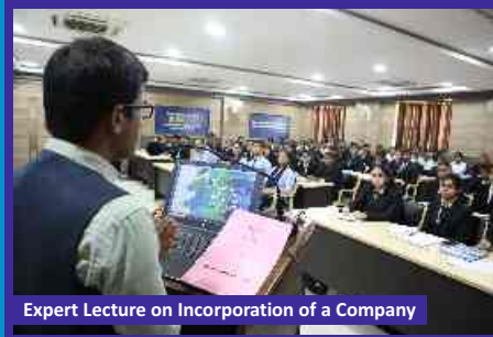
Expert Lecture on Incorporation of a Company