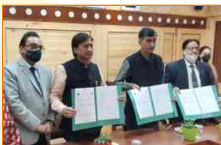
MOU with Himachal Pradesh University