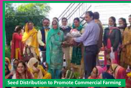
Seed Distribution to Promote Commercial Farming