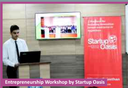
Entrepreneurship Workshop by Startup Oasis