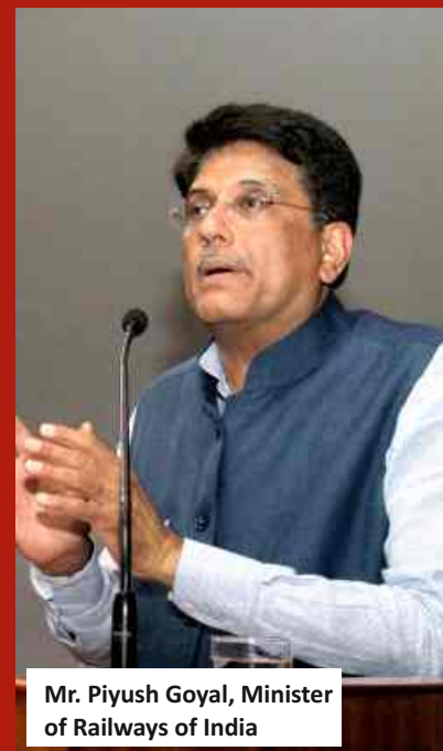
Mr. Piyush Goyal, Minister of Railways of India