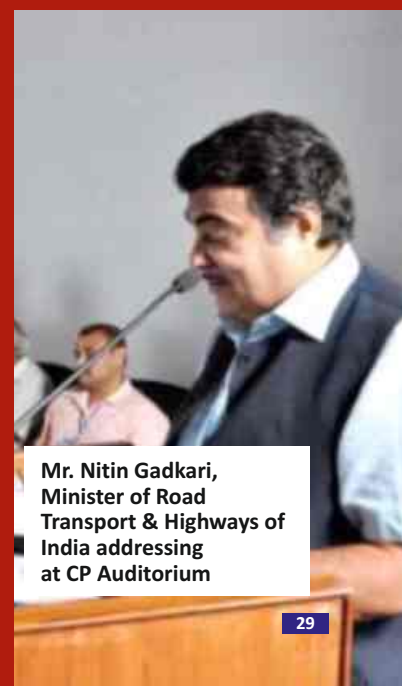
Mr. Nitin Gadkari, Minister of Road Transport & Highways of India addressing at CP Auditorium