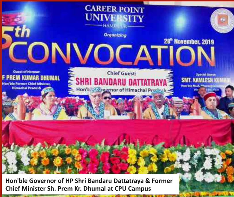
Hon'ble Governor of HP Shri Bandaru Dattatraya & Former Chief Minister Sh. Prem Kr. Dhumal at CPU Campus