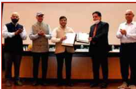
MOU with IHBT-CSIR campus at University of Agri. Sciences & Technology of Jammu (SKUAST-J)