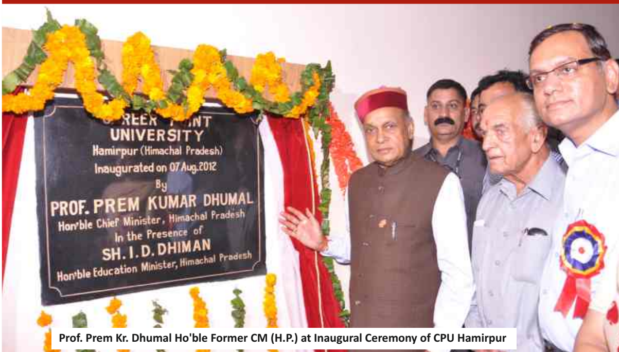
Prof. Prem Kr. Dhumal Ho'ble Former CM (H.P.) at Inaugural Ceremony of CPU Hamirpur