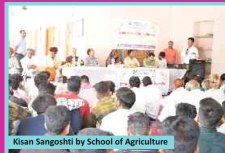
Kisan Sangoshti by School of Agriculture