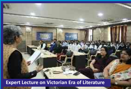
Expert Lecture on Victorian Era of Literature