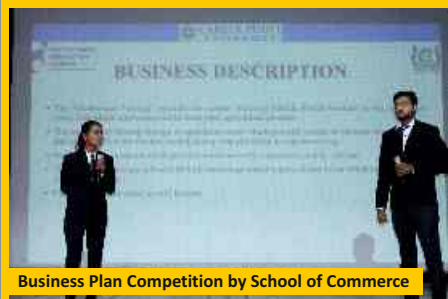
Business Plan Competition by School of Commerce

CPU encourages students to actively engage in various activities for intellectual development. Various events like Academic Conferences, Paper Presentation, Project, Tech-Exhibitions and participation in IITs events. Experts Lectures, Technical Workshops & Seminars, industrial Visit and working on Live Projects complement classroom learning and foster academic & technical leadership of students.