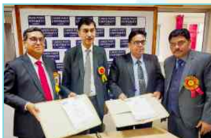
MOU with GESCO Healthcare Pvt. Ltd and Allign Consultancy Pvt. Ltd