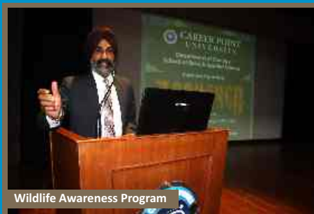
Wildlife Awareness Program