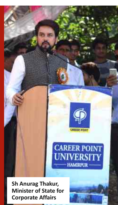
Sh Anurag Thakur, Minister of State for Corporate Affairs