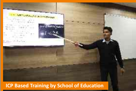
ICP Based Training by School of Education