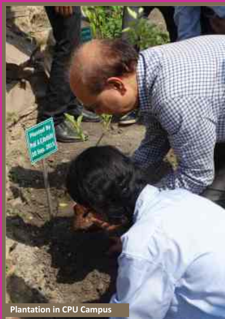
Plantation in CPU Campus