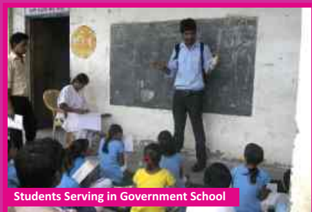
Students Serving in Government School