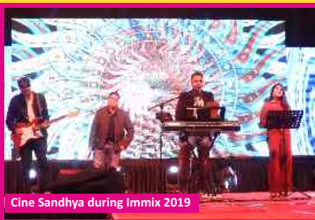
Cine Sandhya during Immix 2019