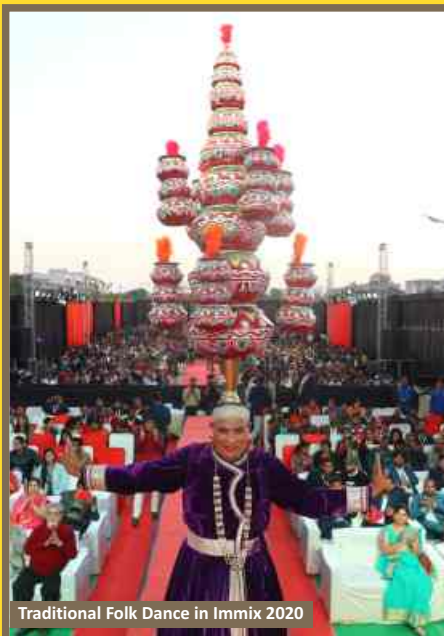
Traditional Folk Dance in Immix 2020