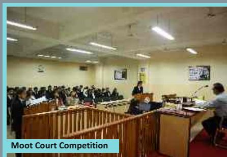
Moot Court Competition