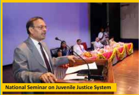
National Seminar on Juvenile Justice System

We understand that student's success is not solely defined by grades - in today's world students must have excellent life skills. Skills like - leadership skills, team skills, decision making, ability to think on feet, presentation skills, analytical bent of mind, innovation, Pleasing personality, communication skills, positive attitude etc. are few of the qualities which we aim to develop among the students through various student development programs hence enabling them to effortlessly face the challenges of corporate world.