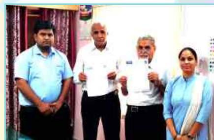
MOU with Department of Agriculture (Extension), Govt. of Rajasthan, Kota