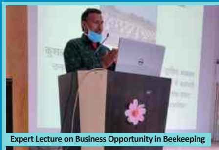
Expert Lecture on Business Opportunity in Beekeeping