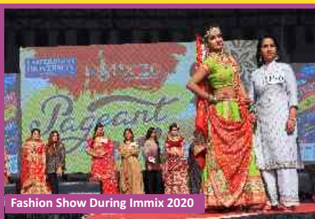
Fashion Show During Immix 2020