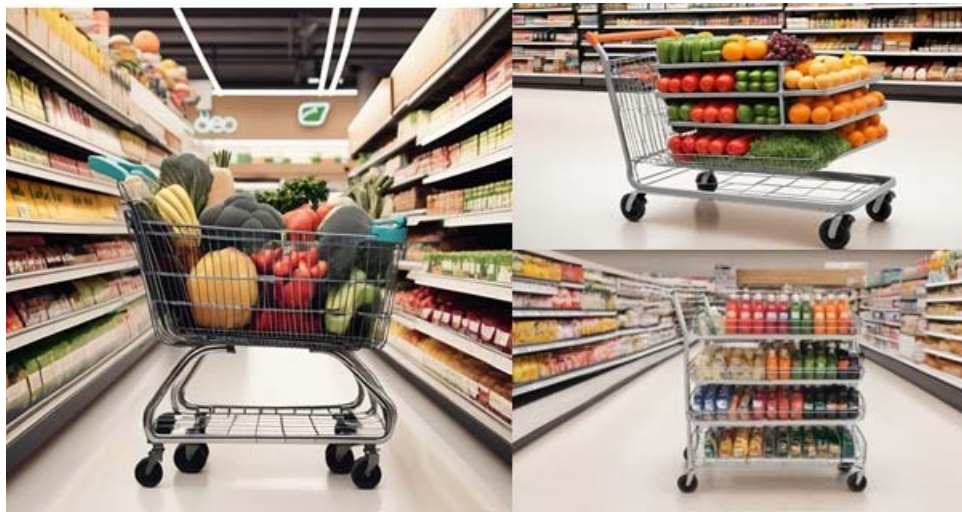
Figure 10.1 IDEO's Redesign of Grocery Carts