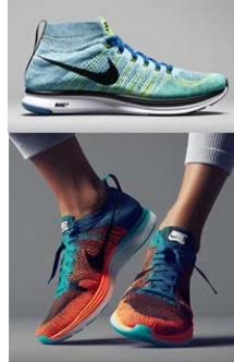
Figure 10.2 Nike's Flyknit shoes

d) Nike's Flyknit Shoes: Nike's Flyknit shoes demonstrate HCD principles applied to product design in the athletic footwear industry. Nike's design team collaborated with athletes to understand their performance needs and preferences. They developed Flyknit technology, which uses lightweight, flexible materials to create seamless, form-fitting uppers for running shoes. By prioritizing comfort, breathability, and performance, Nike's Flyknit shoes offer a personalized and responsive experience for runners, enhancing their performance and reducing the risk of injury.