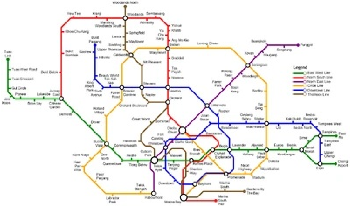
Figure 10.3 MRT System

e) Singapore's Mass Rapid Transit (MRT) System: Singapore's MRT system is a transportation infrastructure project that exemplifies HCD principles in urban planning and public transit. The design of the MRT stations and trains prioritizes accessibility, safety, and efficiency for passengers of all ages and abilities. Features such as barrier-free access, tactile flooring, and priority seating for elderly and disabled passengers demonstrate a commitment to inclusivity and user-centered design. Singapore's MRT system has become a model for sustainable and efficient urban transportation, serving millions of commuters each day with minimal disruptions and delays.